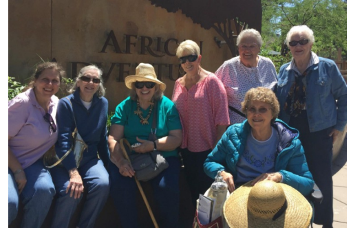
UMW May Outing to the Chaffee Zoo

SAVE THE DATE; Sat. August 20th at 11:30 p.m. our UMW will host a Fashion Show for the benefit of the kitchen in Fellowship Hall. More information later.